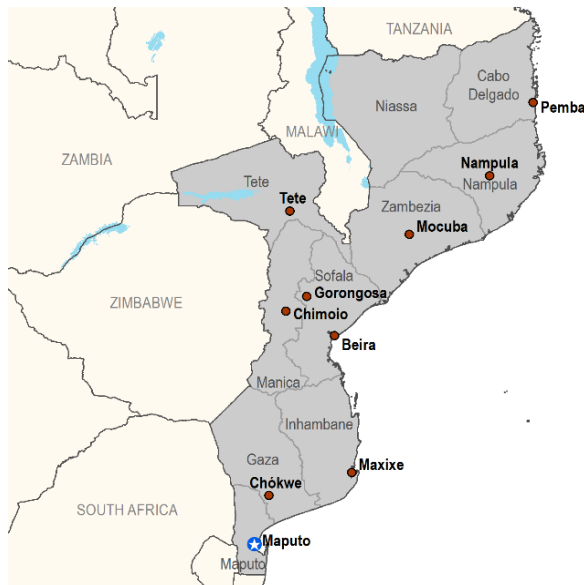
FEWS NET gratefully acknowledges the Ministry of Agriculture/SIMA

The Famine Early Warning Systems Network (FEWS NET) monitors trends in staple food prices in countries vulnerable to food insecurity. For each FEWS NET country and region, the Price Bulletin provides a set of charts showing monthly prices in the current marketing year in selected urban centers and allowing users to compare current trends with both five-year average prices, indicative of seasonal trends, and prices in the previous year.